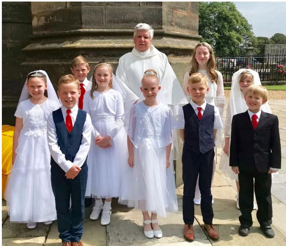
The Children on their First Holy Communion day